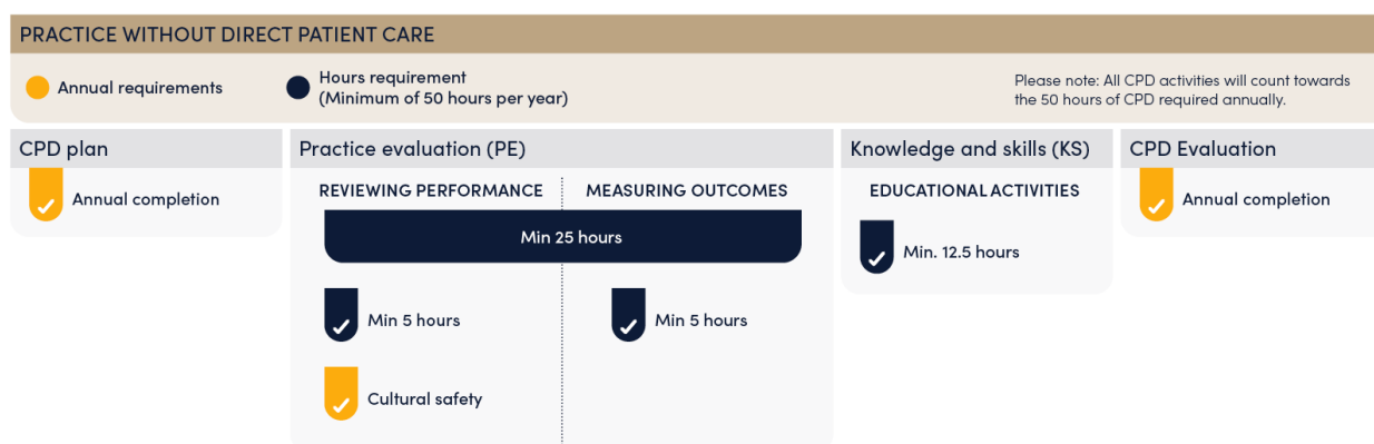
Figure 3: CPD requirements (practice without direct patient care)

As required by the MBA and MCNZ, your program runs on an annual cycle (from 1 January to 31 December). If you click on the following links, you will find greater detail on each of the requirements for each category and how these can be achieved for those without direct patient care.