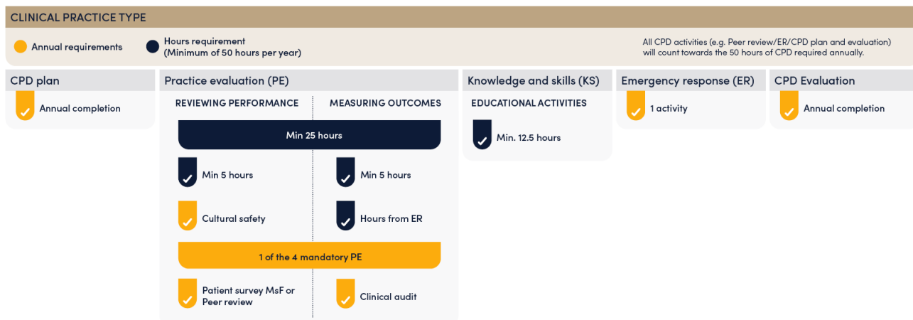
Figure 1: CPD requirements (clinical practice type)

Your program runs on an annual calendar cycle (from 1 January to 31 December). If you click on the following links, you will find greater detail on each of the requirements.